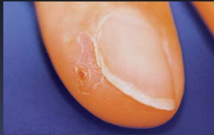
After using Gloves In A Bottle